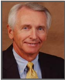
Steven L. Beshear (D)