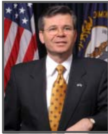
Ernie Fletcher (R)