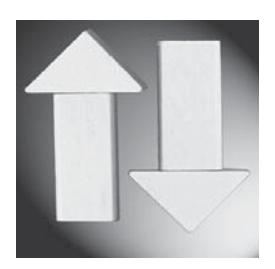
Words to Ponder

"Investors should remember that excitement and expenses are their enemies. And if they insist on trying to time their participation in equities, they should try to be fearful when others are greedy and greedy when others are fearful."