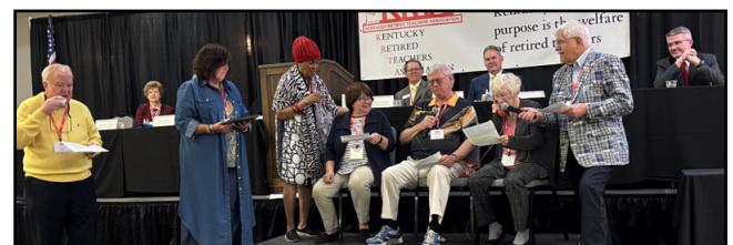
"Looking for a Sub" Skit