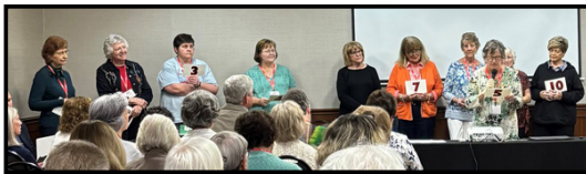
Membership Workshop The Northern District